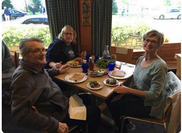
Breakfast at Al Johnson's, Sister Bay